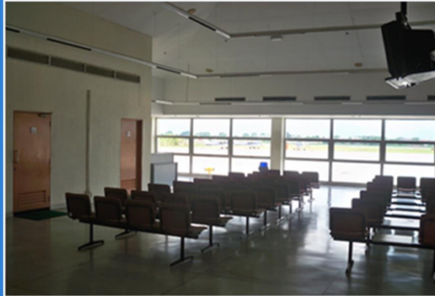
Departure hall before upgrading works