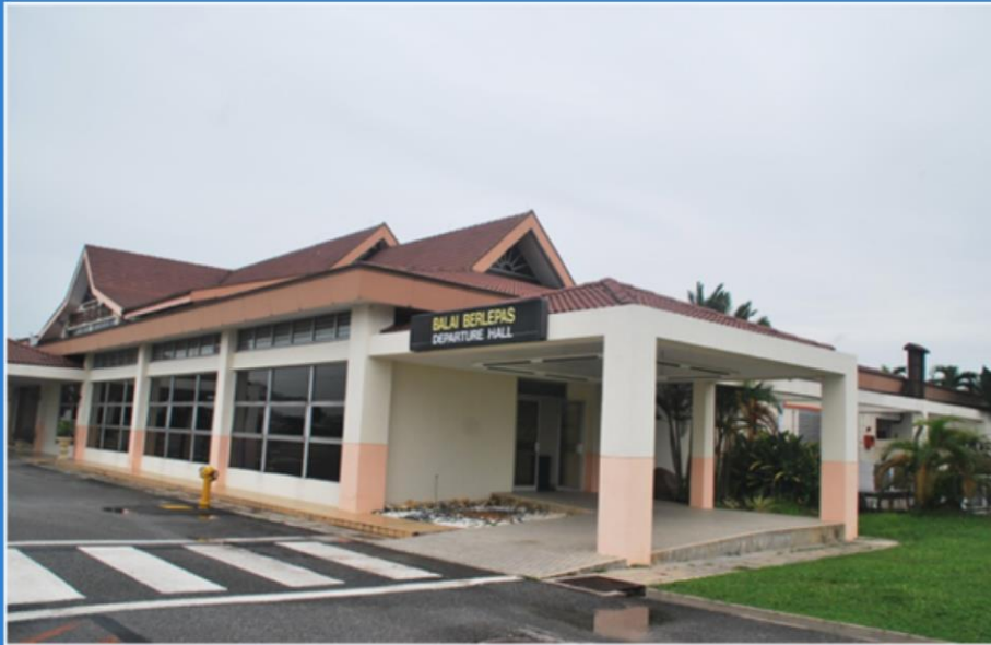
Terminal Building façade (airside view) after upgrading works