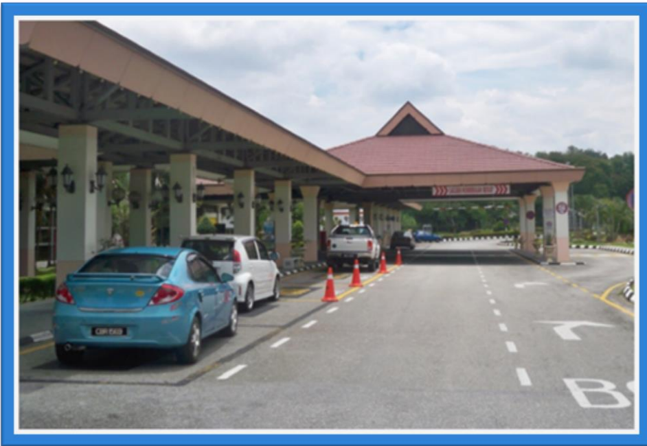
Drop off area after upgrading work