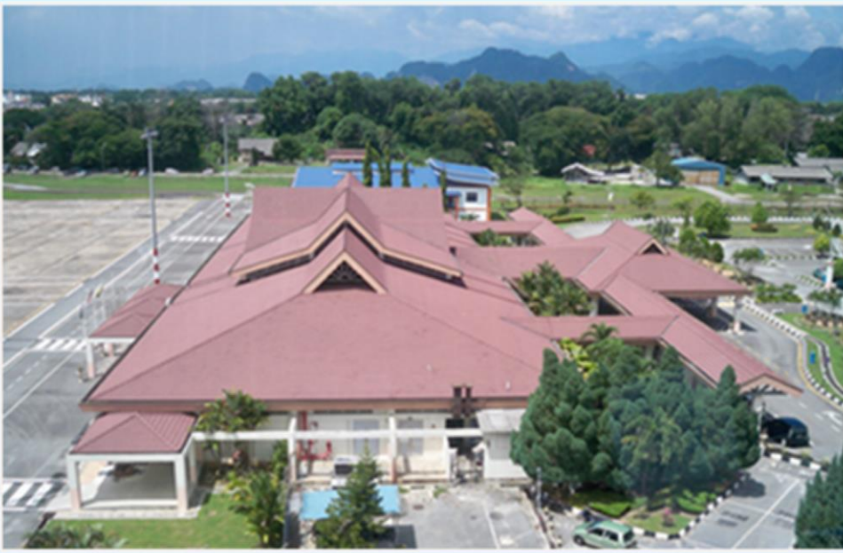
Terminal Building Roofing before upgrading works