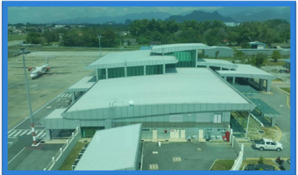
Terminal Building Roofing after upgrading works