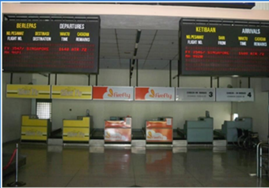
Check In Counter before upgrading works