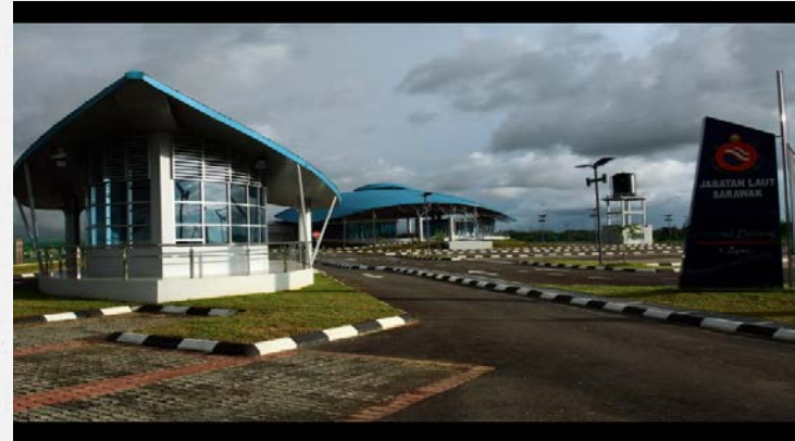
17) Pandang Waktu Siang Dari Hadapan