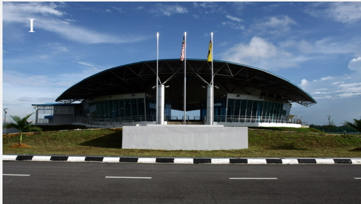
18) Pandangan Hadapan Rumah Kelab