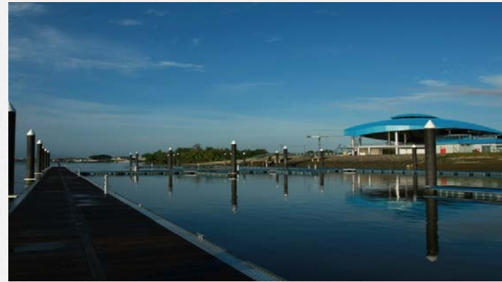
19) Pandangan Waktu Dari Sistem Pontoon