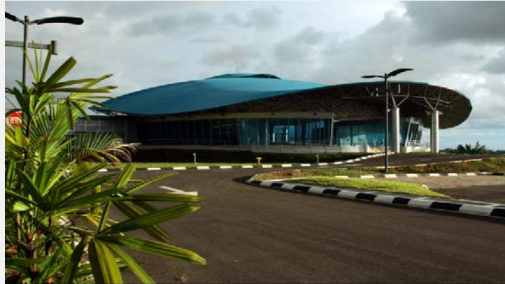
16) Pandangan Waktu Siang Dari Kiri