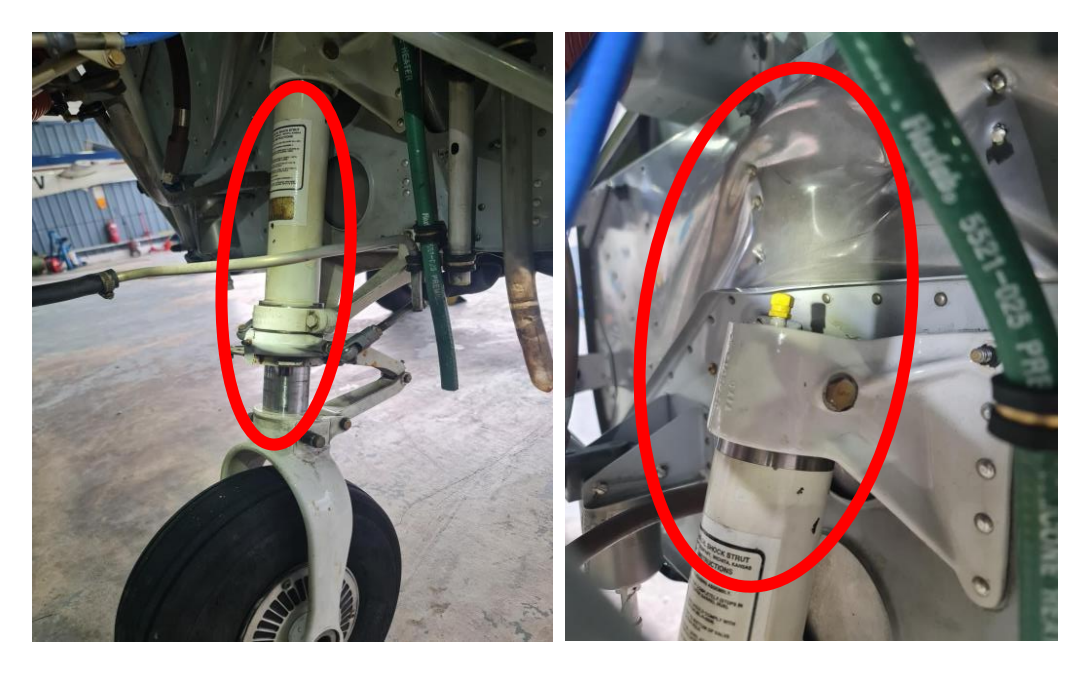
Figure 3: Nose landing gear. Damaged on riveted joints.