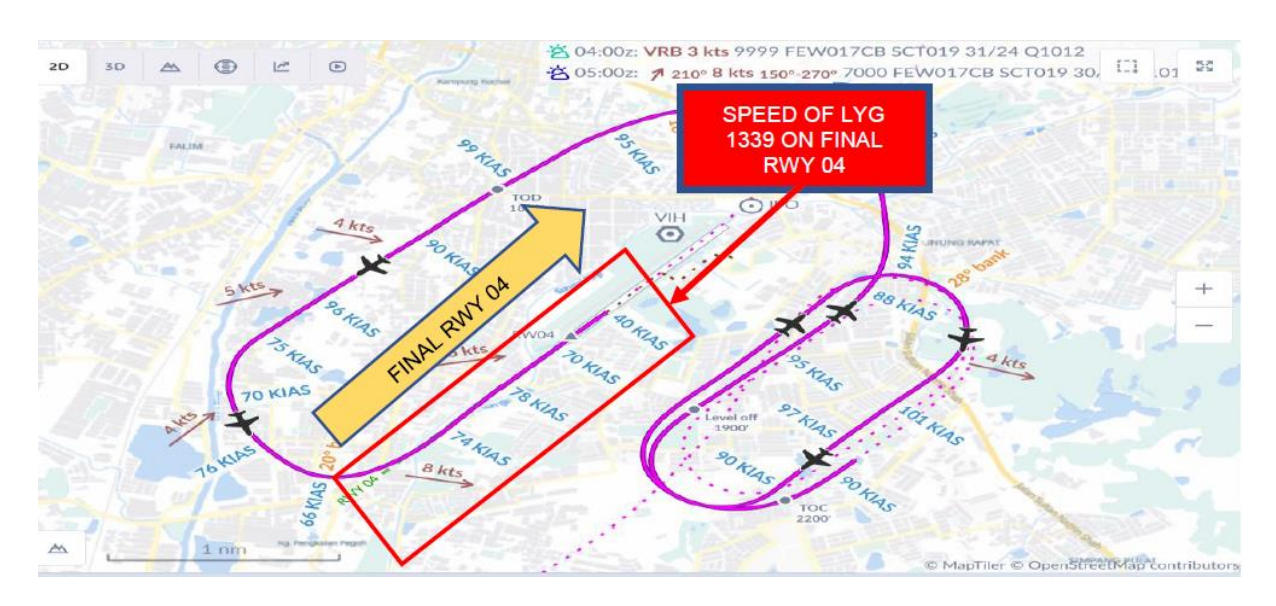
Figure 14: Data from Garmin G1000 shows the speed of the aircraft on the final to land