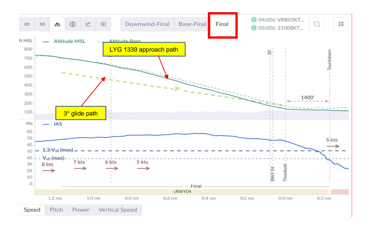
Figure 13: Data extracted from Garmin G 1000 shows the flight path of the aircraft during the final approach to land.