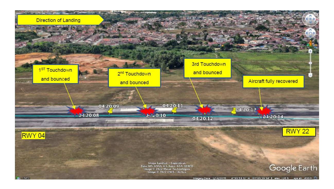
Figure 10: Landing path (Diagram not to scale)