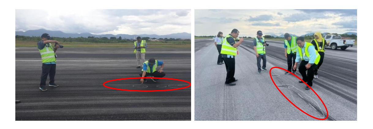
Figure 12: Scratched marking from the propeller on the runway during the hard landing.