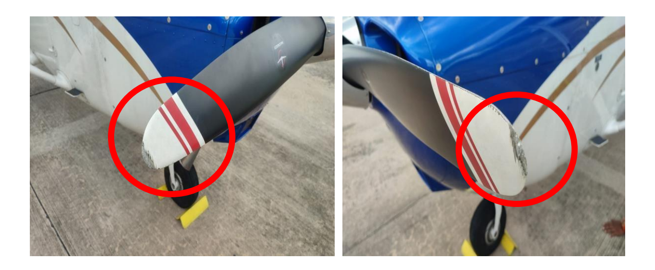
Figure 2: All Propeller blades bent inwards at the blade tips.