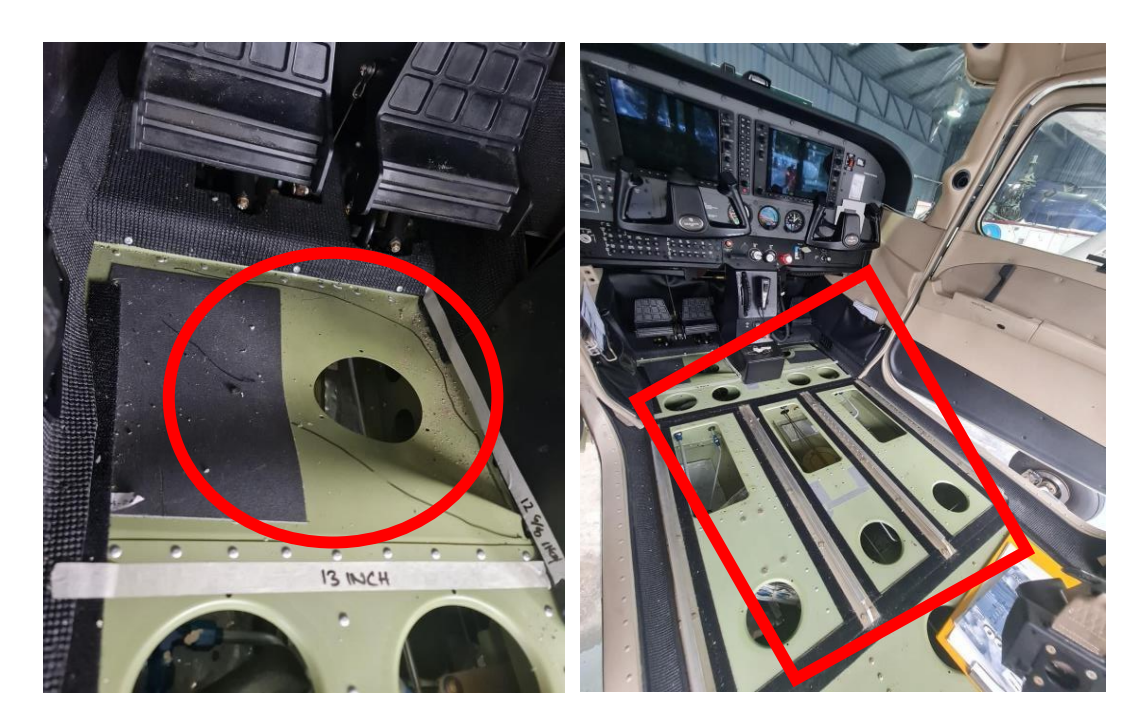
Figure 5: Forward Left and Right Floorboard Assembly found wrinkled and buckled.