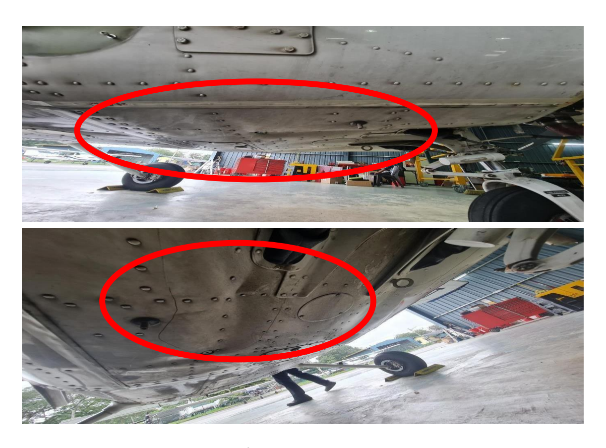
Figure 4: Below fuselage. Found deep scratches.