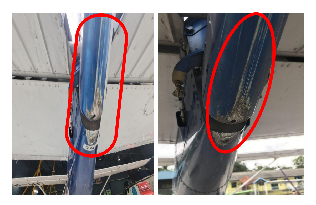
Figure 6: Rudder Lower tip found scratches