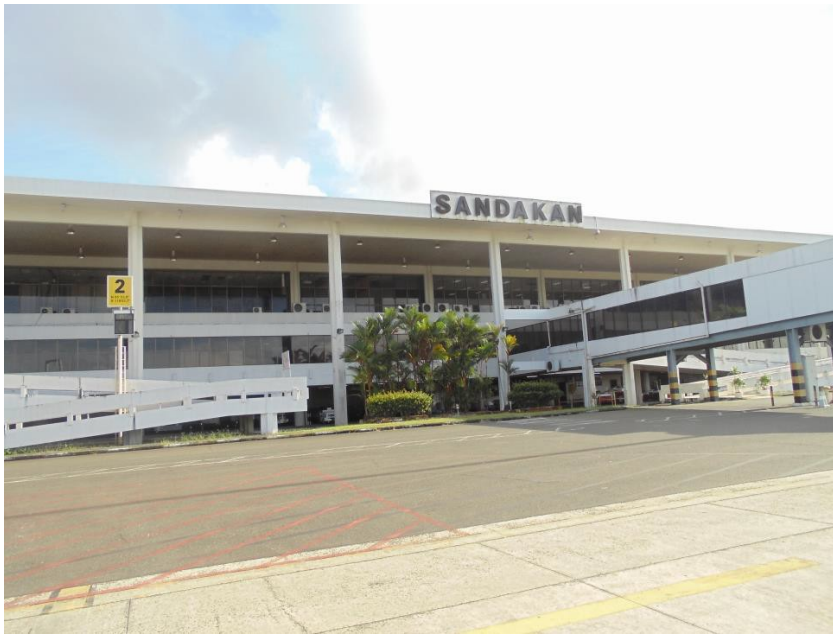
Picture of Sandakan Airport Terminal before upgrading process (airside view)