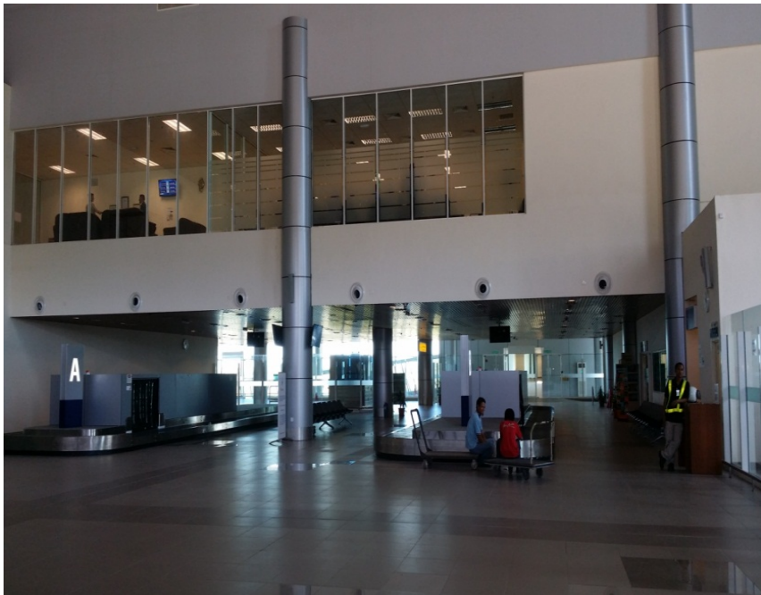
Picture of Sandakan Airport Terminal before upgrading process (baggage carousel)