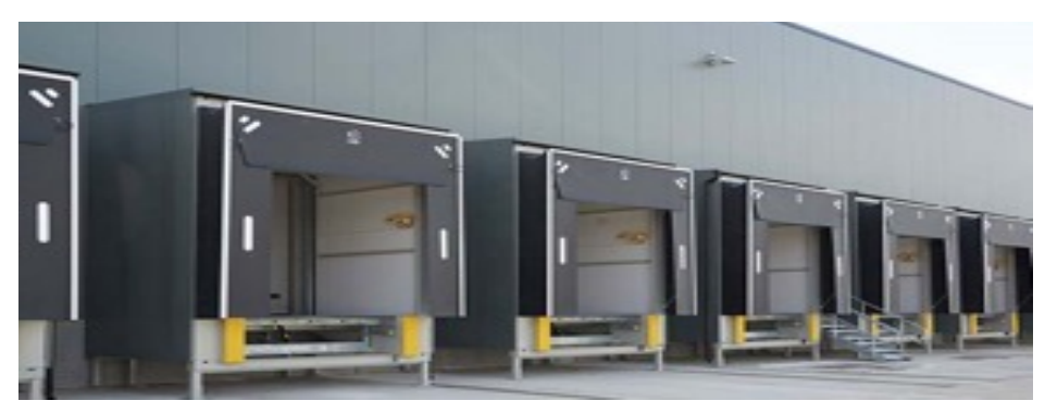
Figure 2 - Cold Storage Warehouses

Cold storage warehouses are designed to maintain the quality, health and safety of perishable materials and products and general supply materials that require cold spaces for storage, with temperatures that vary between zero and 4 degrees for chilling, and zero and minus 16 degrees for freezing. In addition to general warehouses requirements, they include specific spaces for freezing and cooling, as well as equipment facilities and specific areas for mechanical equipment.