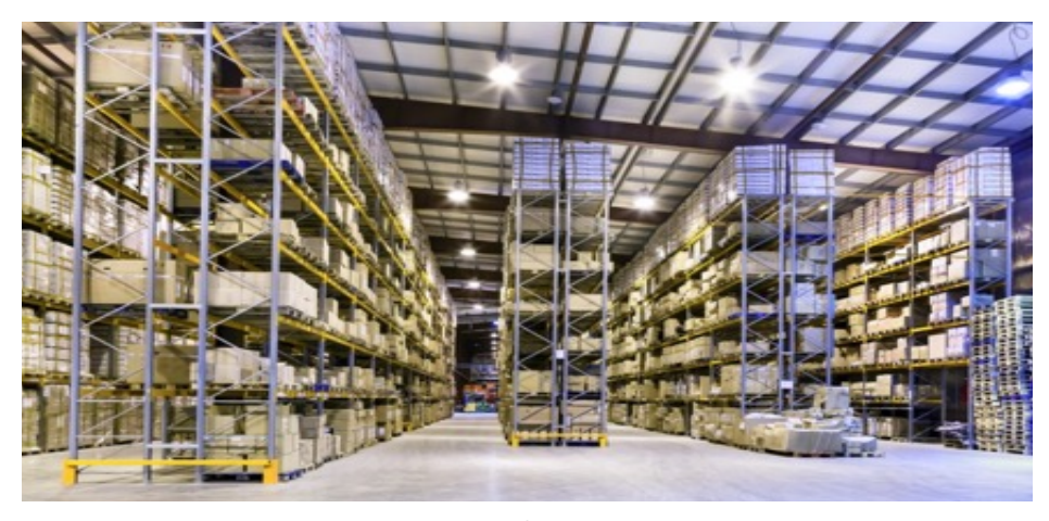
Typical example of a Racking System

The degree of hazardousness of goods during the handling or movement