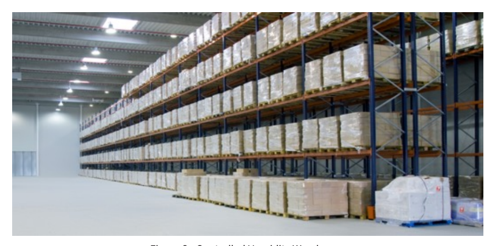
Figure 3 - Controlled Humidity Warehouse

Controlled humidity warehouses resemble general ones in all aspects, except that they are constructed with steam insulating barriers. They contain control equipment in order to maintain a specific humidity level inside the building. The warehouse building can be separate or adjacent to a general warehouse.