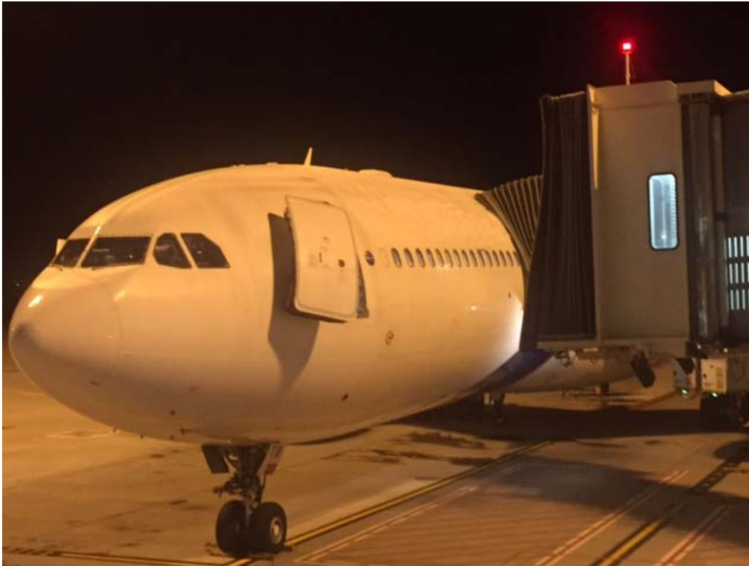
Figure 2: The aircraft’s forward fuselage showing the dislocated forward-left door. The slight indentation in the fuselage skin forward of the door is not visible. The aerobridge is shown retracted from its position when struck by the aircraft