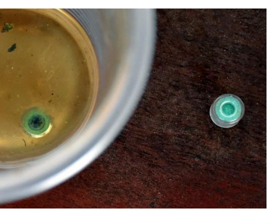
Picture 13 Change of colour of the capsule indicating water exist in the fuel sample